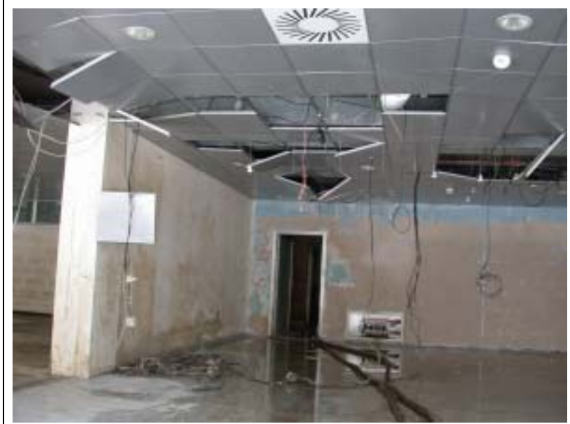
Karlin district in Praha City

Damage is also found on the second floor.