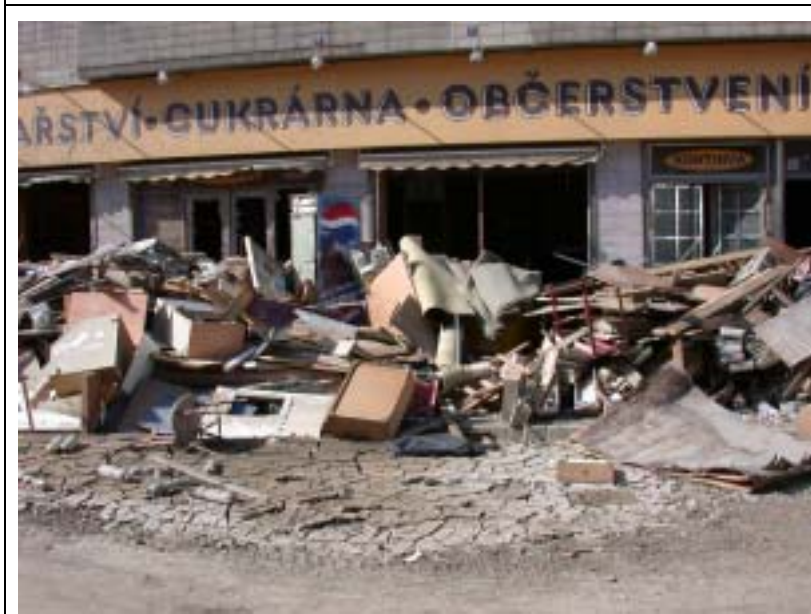
Karlin district in Praha City