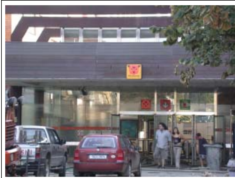
Karlin district in Praha City

Unusable furniture is heaved up. On the ground is mud left by the flood.