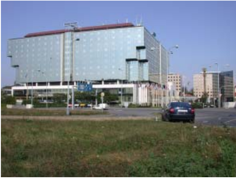
Karlin district in Praha City

The Hilton Hotel closed temporarily due to the inundation of the basement.