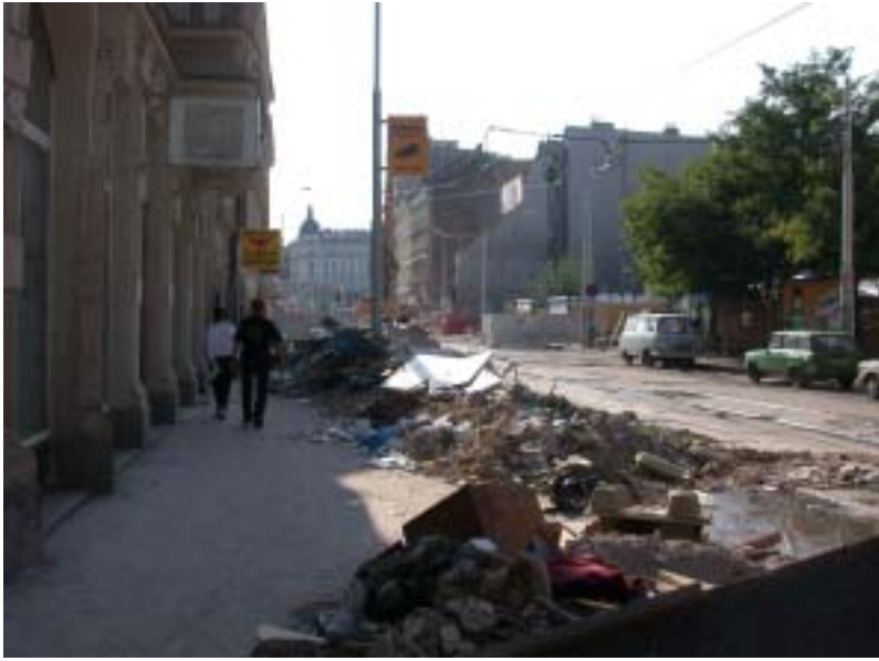
Karlin district in Praha City