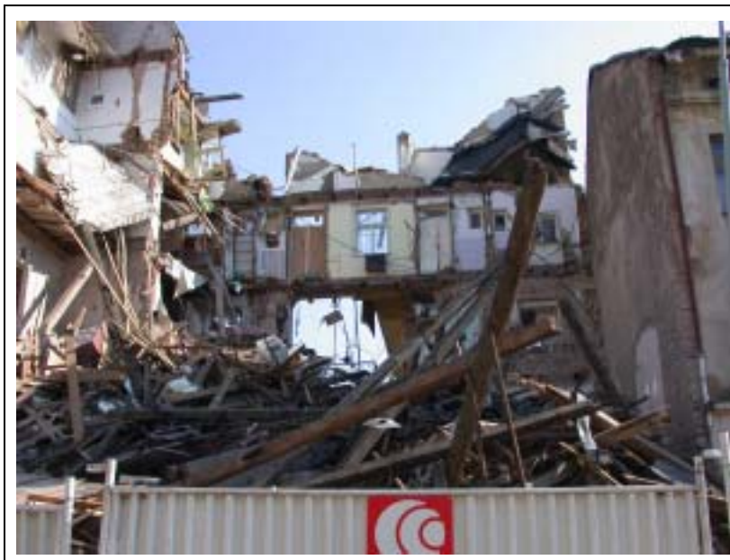
Karlin district in Praha City