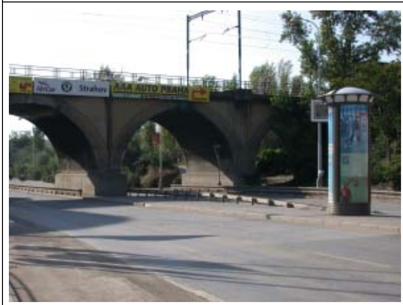
Karlin district in Praha City

Damage is also found on the second floor.