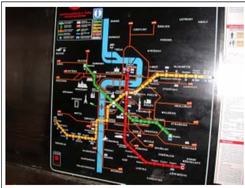
Karlin district in Praha City