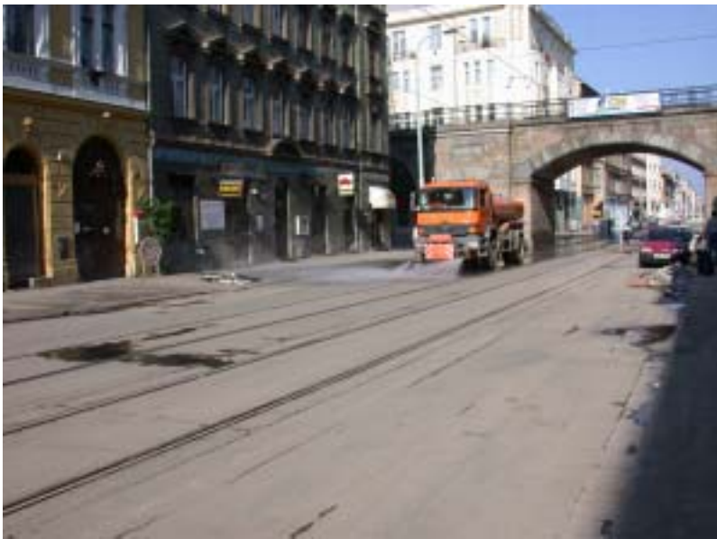
Karlin district in Praha City

A road cleaning car is washing mud off a road surface.