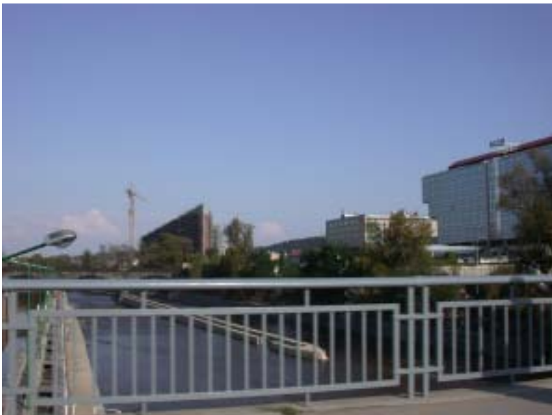
A view of Karlin district from the upstream side of the Vltava river.

The Hilton Hotel closed temporarily due to the inundation of the basement.