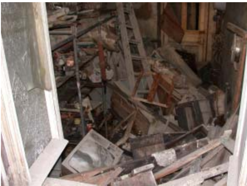
Karlin district in Praha City

A road cleaning car is washing mud off a road surface.