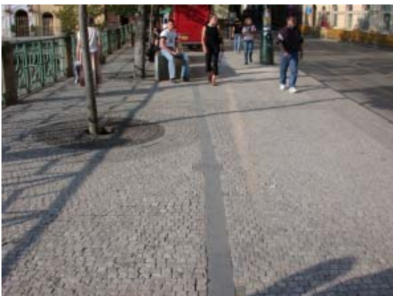
Vltava river right bank Old town