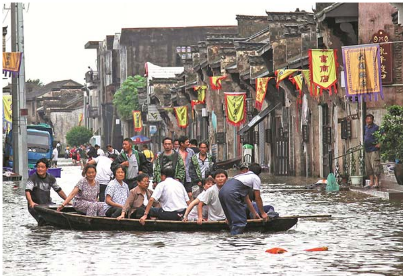
Tongling, Anhui July 2, 2016 (China Daily)

Source: http://www.sahafaarabia.net/news3206768.html