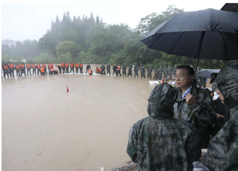
Premier Li Keqiang reviewing flood protection activities July 5, 2016 (Ministry of Civil Affairs)

Source: http://www.sahafaarabia.net/news3206768.html