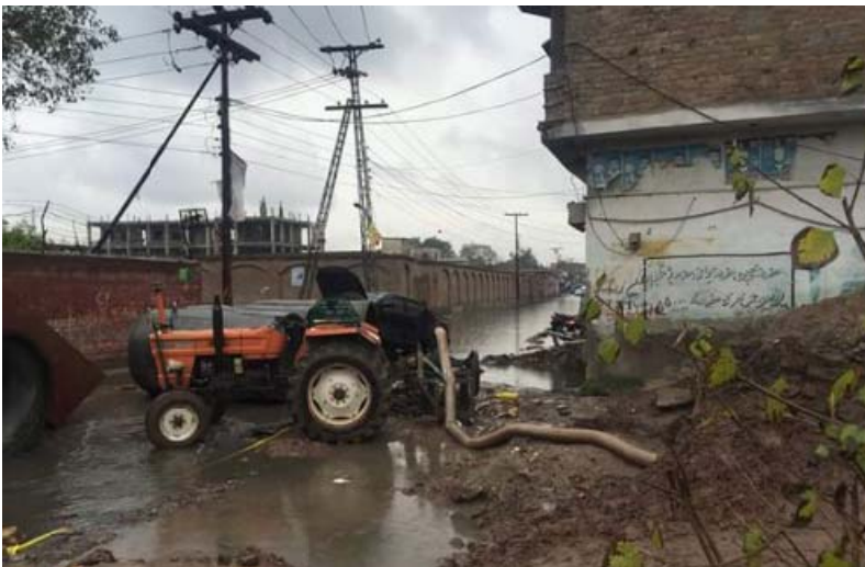
Pumping out the flood water Peshawar, Khyber Pakhtunkhwa March 13, 2016 (PDMA)