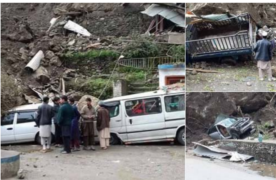
Severe landslide in Shangla Khyber Pakhtunkhwa April 6, 2016