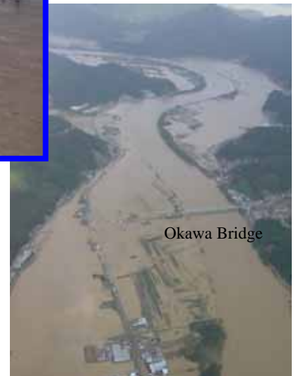
(5) Okawa Bridge on Yuragawa River (Kyoto Prefecture, Maizuru) October 21, 13:00