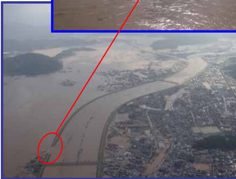
(4) Right Bank of Maruyama River (Hyogo Prefecture, Toyooka) October 21, 9:00