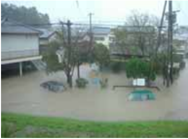
(1) Nanase River, Ooita River System (Ooita Prefecture)