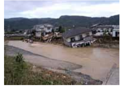
(3) Honzu River (Kagawa Prefecture)