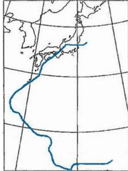
TOKAGE Typhoon Track

The typhoon that developed in the vicinity of the Mariana Islands at around 0900 JST on October 13, 2004, gained momentum as it moved in a northwesterly direction, and by 0900 on the 18 th it was of extraordinary force when it approached the Okinawa Islands from the south. After striking the main Okinawa Island and sweeping by the Amami Islands on the 19 th , the typhoon struck the south coast of Shikoku district at around 1300 and reached the vicinity of Izumisano City in Osaka Prefecture a little before 1800 on the 20 th retaining its mighty force all the while. At 900 on the 21 st , it turned into an extratropical cyclone off the east coast of the Kanto area after transversing East Japan.