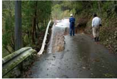
(2) Iyomishima Line (Kochi Prefecture)