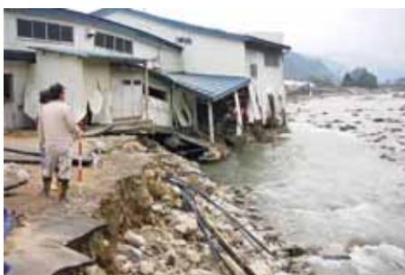
(6) Kawaue River, Jinzu River System (Gifu Prefecture, Kiyomi)